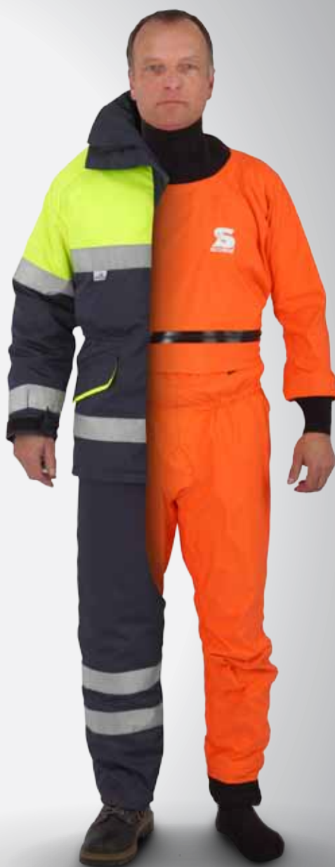
Breathable, waterproof undersuit – wearable under normal work clothing