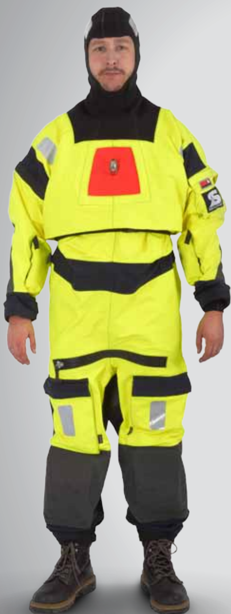
Breathable, waterproof work and survival suit with integral fall-arrest harness